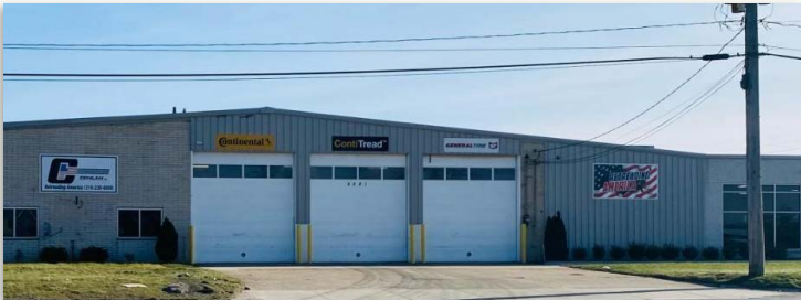
Conlan Tire // 5281 Engle Rd.