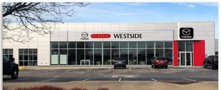
Classic Westside Mazda // 13930 Brookpark Rd.