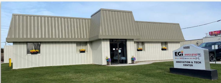
EGI Envirogroup // 14800 Brookpark Rd.