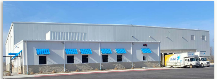
Corrigan Movers // 13900 Keystone Pkwy.