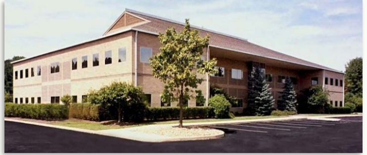
Federal Aviation Admin. // 2000 Aerospace Pkwy.