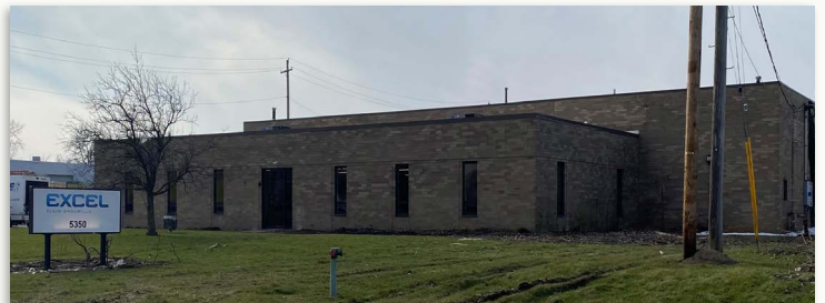
Excel Fluid Group // 5350 West 137th. Street