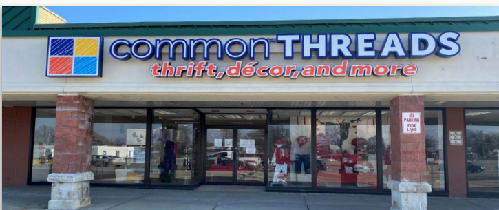
Common Threads // BrookGate Shopping Center