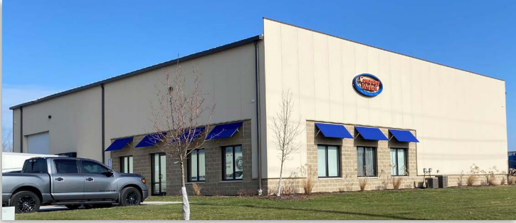
Company Wrench // 16400 Brook Park Rd.

Combined this is a $14 million dollar investment in our community and over 250 new jobs!