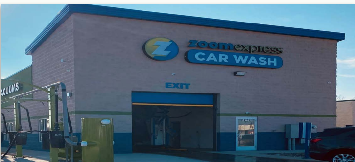
ZOOM Car Wash // 14755 Snow Rd.